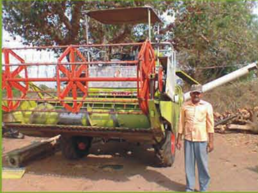
Ganesh Ambadas Phate