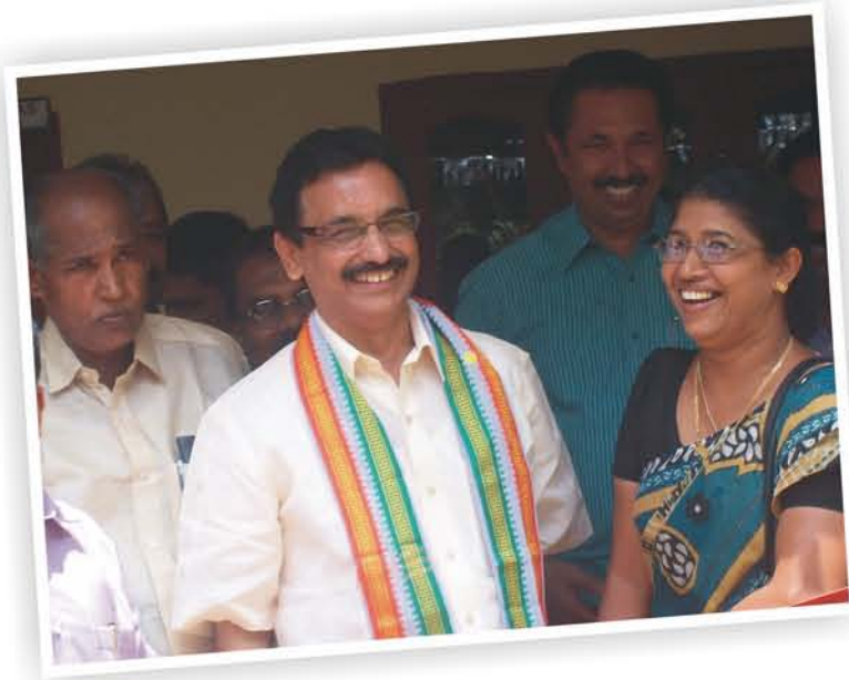
CROP TIGER 30 TERRA TRAC flag off ceremony done by Agriculture Minister Mr. K. P. Mohanan

The Kerala Agro Industries Corporation Ltd. (KAICO) is a joint venture of Government of India and Government of Kerala established in 1968. This institution in Kerala is involved in providing service support to farmers, Popularization of machinery and acts as a catalyst to farm mechanization programme.