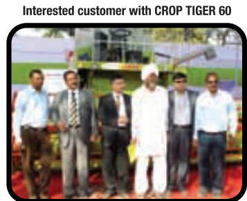
Interested customer with CROP TIGER 60