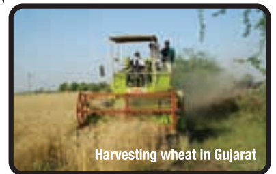
Harvesting wheat in Gujarat