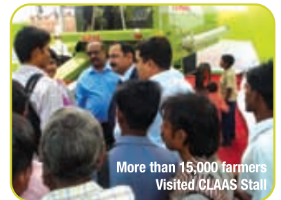
More than 15,000 farmers Visited CLAAS Stall

CLAAS exhibited the new CROP TIGER 30 combine harvester, at Kisan Tak - 'Kumbh' Exhibition 2009 in Phulpur, near Allahabad U.P from 25 th February to 1 st March'09. This is the biggest agricultural exhibition in Eastern (UP) region and witnessed a footfall of more than 15,000 farmers. Apart from the participation from leading Agro - Manufacturers in this mela, lots of cultural programs were organized to entertain the visitors.