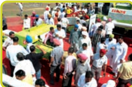
More than 50,000 farmers visited CLAAS stall