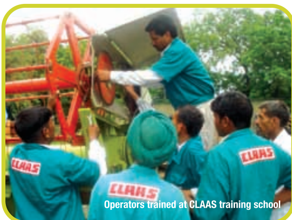
Operators trained at CLAAS training school

CLAAS India organizes Operators Meet at a regular intervals for new and existing operators to equip them with up-to-date technical knowledge on Combine Operating Skills. The operators are trained at CLAAS training school for 3 days. The training curriculum includes providing knowledge about the CLAAS product range, right operating mechanism to improve the combine's efficiency, maintenance and servicing tips of the combines during the harvest