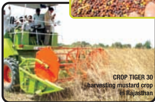
CROP TIGER 30 harvesting mustard crop in Rajasthan