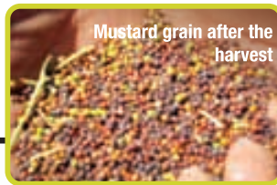
Mustard grain after the harvest