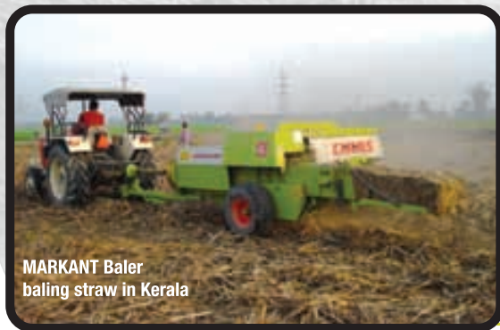
MARKANT Baler baling straw in Kerala